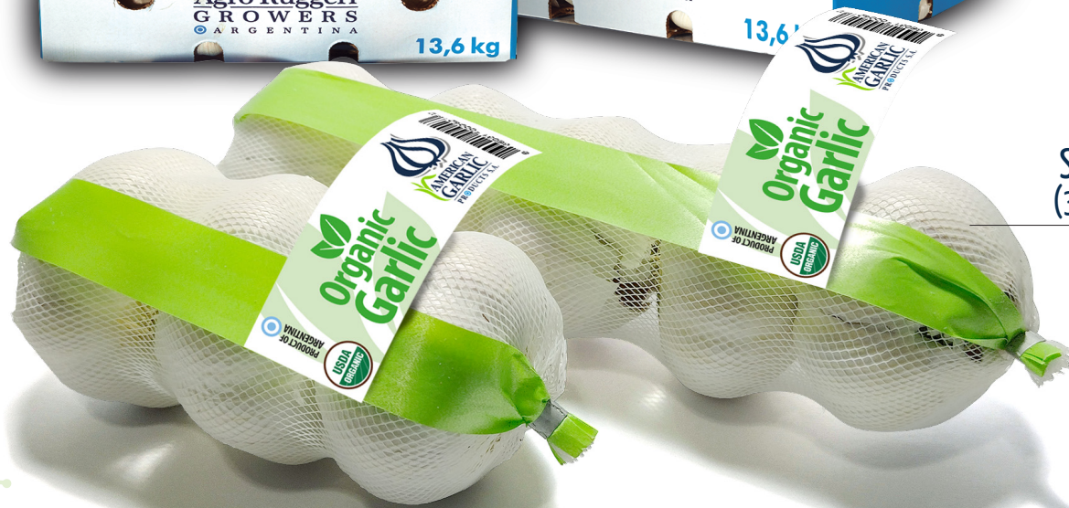
SLEEVES GARLIC (3 or 5 pieces)